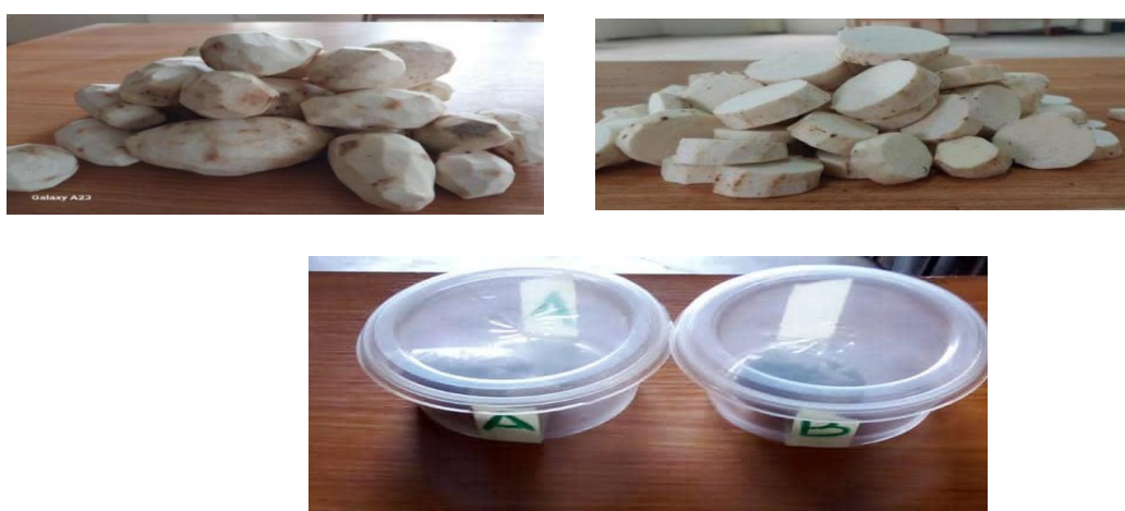
Figure 1: Pictorial description of processing stages of cocoyam flour

The cocoyam samples of cultivar (1 kg) were sorted, washed with potable water to remove adhering soil, and peeled manually with stainless steel knife. The peeled root crops were washed with portable water and sliced into 10 mm thickness and soaked into 0.02% solution of sodium metabisulphite for 30 min to prevent oxidation browning. The sliced samples were divided into two equal batches with the first batch sun dried while the second batch were oven dried using Multipurpose oven (Model N0: MCQTR54) at 70°C for 60 minutes internal until constant drying rates are attained. The dried cocoyam samples were then milled into flour using hammer mill, sieved through a standard laboratory sieve of 500-micron meter aperture to produce uniform particle size flour, packaged in polythene bags, sealed and then stored in air tight containers with appropriate label (A & B) and then carried to the laboratory where the samples were investigated. The sample preparation stages are shown in figure 1.